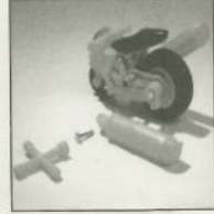
Screw goes through exhaust mount and hooks up to the bike.