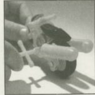
Use your custom wrench to swap out the exhausts.