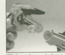
With the regular rear wheel removed, slide pro street swing arm into position. Note: You may need to wiggle while sliding it in.