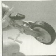
Insert rear axle screw and carefully tighten. Note: Do not over tighten.