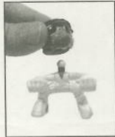
Swap out headz from other riders.