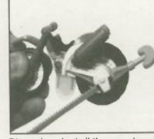
Ripcord pushed all the way down at the correct angle.