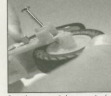
Once the screw axle is removed, wiggle rear wheel from rear swing arm. Note: You may need to slightly open up both halves of the swing arm, ask your parents for help.