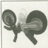
Kick stand clipped into position for stand-up displaying and smoother performance.