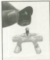
Headz can pop off bodies Note: If arms or legs come off, pop them back into place.