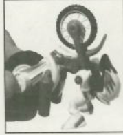
Riders should hang on even upside down.