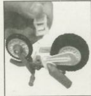
Kick stand can be removed for extra performance.