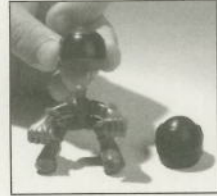
Socket rider comes with 2 helmets which can be interchanged.