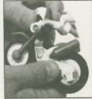
Clip hands on to handle bars. Note: Body can be posed in cool positions.