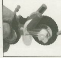
Carefully slide ripcord end into wheel gear area. Note: Make sure flat side of ripcord faces outward.