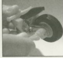
Use your custom wrench to loosen and tighten the regular rear wheel. Make sure you don't over tighten and check that wheel spins freely. Note: Turn screw counter clockwise to tighten. Turn screw clockwise to loosen.